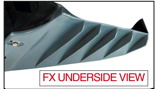
FX UNDERSIDE VIEW

* VOLVO 280,290 & DUO-PROP REQUIRE ADAPTER BRACKET PART#: VB280